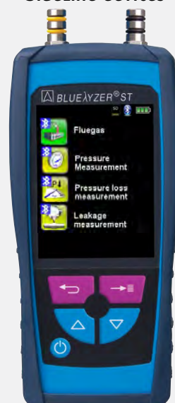
Example on our BLUELYZER ® ST