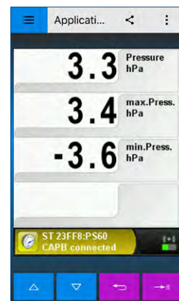
Example for measurement on EuroSoft live app