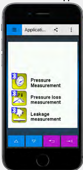
Example on your Smartphone